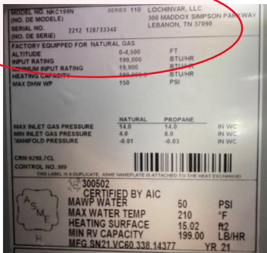
Location of the model number and serial number on data plate