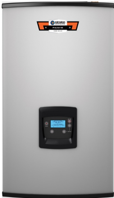
Recalled State Industries condensing residential boiler