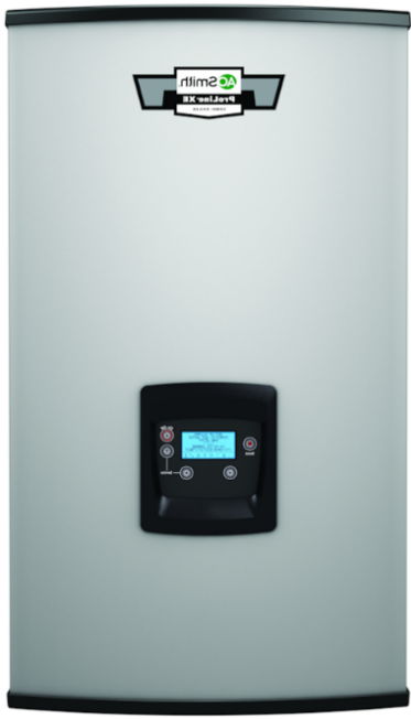
Recalled A.O. Smith condensing residential boiler