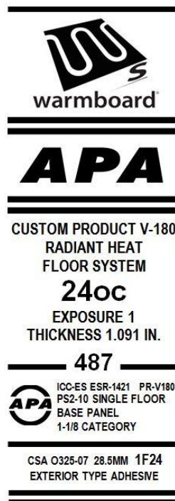
Figure 2. Typical trademark for Warmboard-S panels