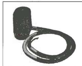
Zurn PEX Actuator

Form No. ZPM08205, 4/08 © 2008 Zurn Industries, LLC