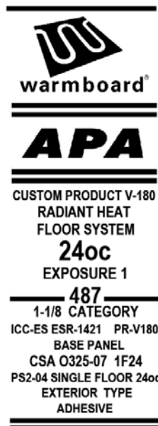
Figure 2. Typical trademark for Warmboard™ panels