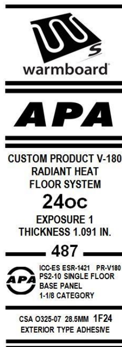
Figure 2. Typical trademark for Warmboard-S panels